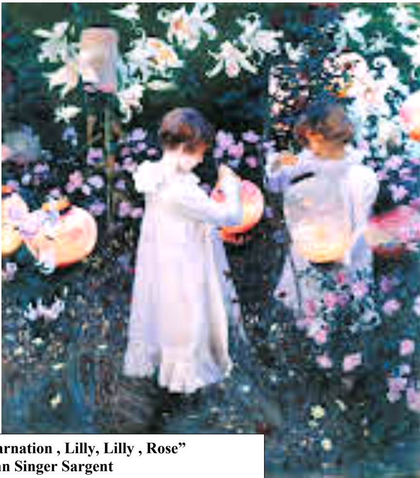
"Carnation , Lilly, Lilly , Rose" John Singer Sargent