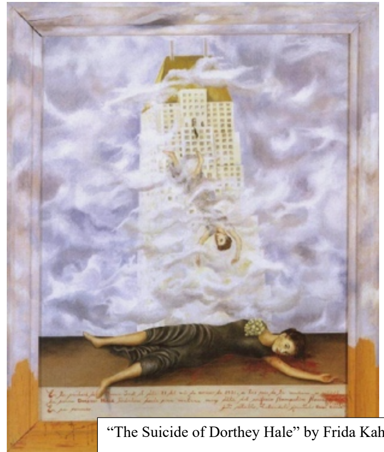
"The Suicide of Dorthey Hale" by Frida Kahlo